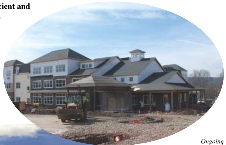
Ongoing construction work at the west side entrance-way to the Villa at Morlatton Assisted Living Facility

In addition to offering general and construction management services, Hollenbach was responsible for providing all of the pre-construction development services on this project. The Villa staff are busily preparing for their summer grand opening.