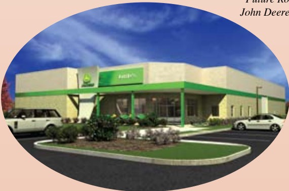
Future Robert E. Little, Inc. new John Deere Dealership to open in Chester County

A new building project in Chester County, PA is also planned in the near future and will be completed by the Hollenbach team. The plans, completed by Lee Architectural