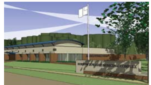
The future depiction of Horsham Township Police Facility currently under construction by Hollenbach

The interior design incorporates an advanced security system, with numerous masonry interior walls for holding cells and prisoner central processing areas. Also included in this project, designed by KCBA Architects in Hatfield, are nine administrative offices, a police squad room and a kitchen/lunchroom area. Hollenbach is working closely with the township and police administrators for a smooth transition upon the completion of the building in September this year.