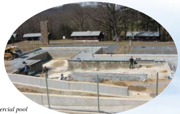
Commercial pool construction for Camp Fowler – Valley Youth House located in Orefield