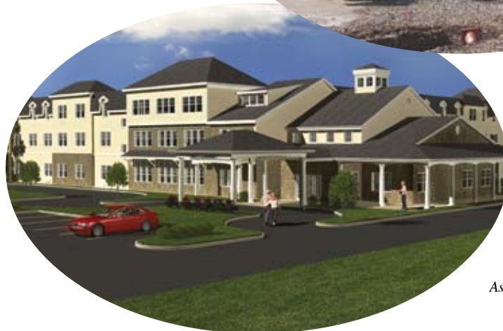
Artist's rendering depicts the future Villa at Morlatton Assisted Living Facility slated to open this summer