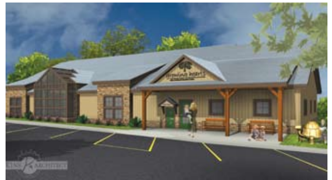
Main entrance of Growing Hearts early Childhood Education Center in Blandon, LEED Green Building to be completed by Hollenbach

Site work will include a 3,000 square foot playground area. The parking area will make use of geo grid pavers to minimize any storm-water runoff . This project is currently scheduled to be completed by Hollenbach in the winter of 2010.